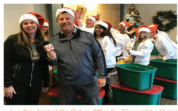
Live Broadcast at the Optum Office for 7Cares Idaho Shares