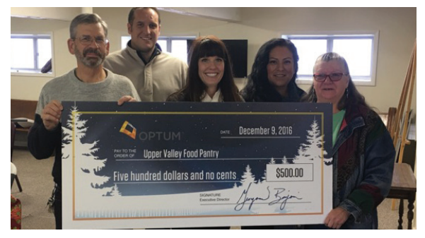
Donation to the Upper Valley Food Pantry in Saint Anthony, ID.