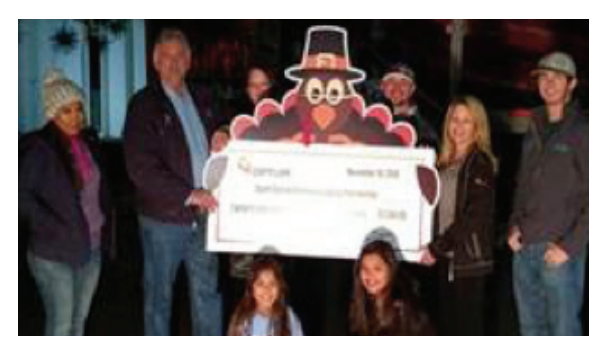
Donation to the S. Central Community Action Partnership